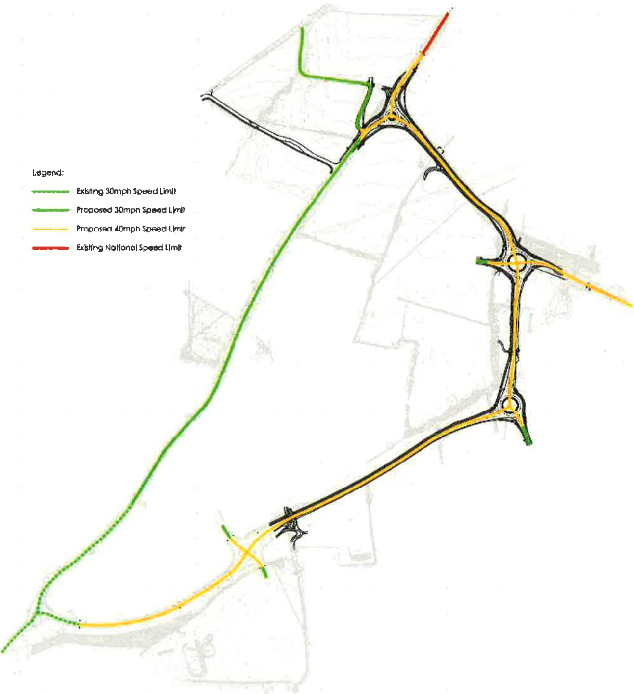
Proposed A38 Speed Limit Changes