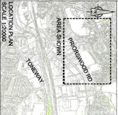
Figure 1: Netherols Farm Cycle Link, Taunton. Scale: 1:20000. Drawing Date: 07/05/15. Drawing No: T1004138-HW-020