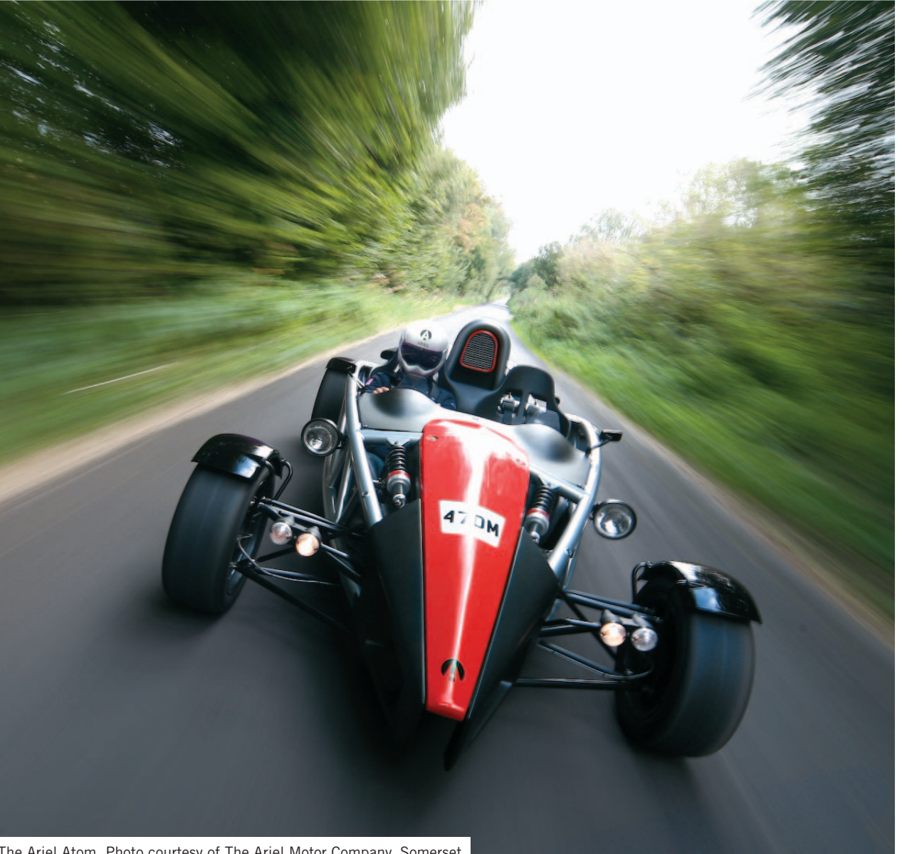
The Ariel Atom.

"We have won a £30m government grant to bring faster broadband connection speeds across Somerset, particularly in remote locations."