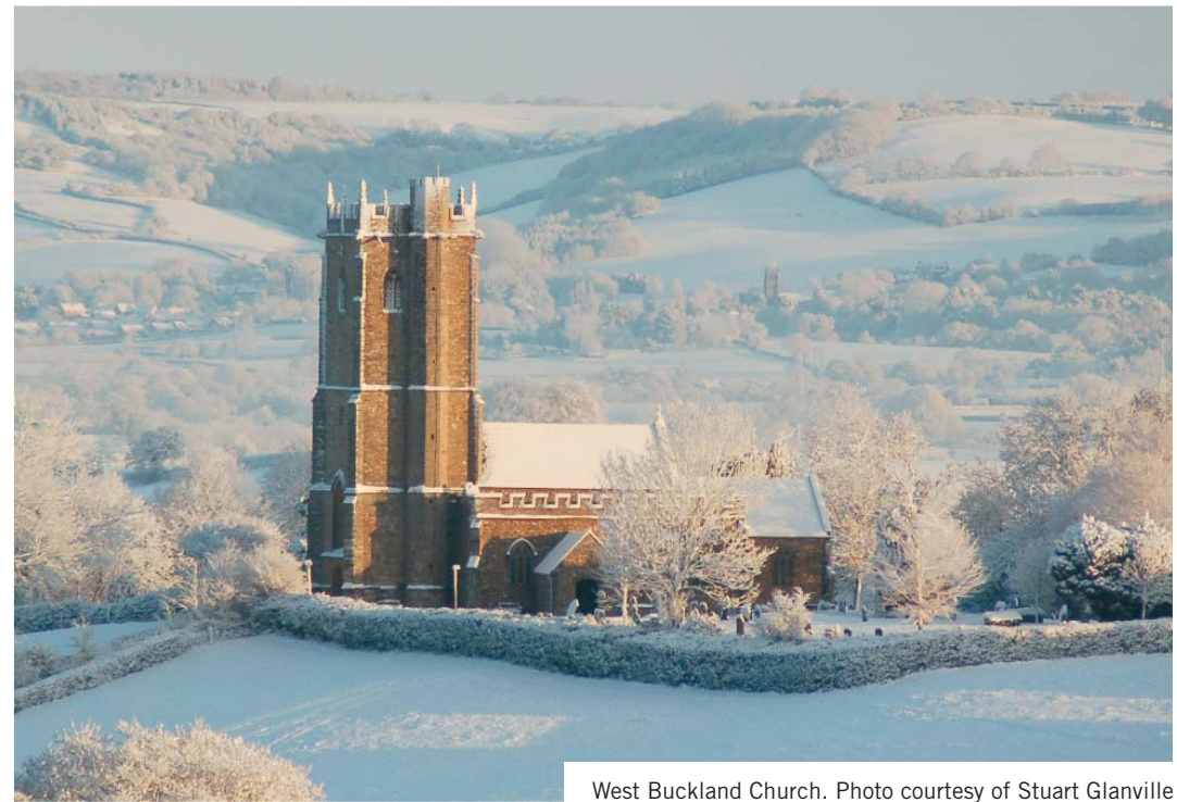
West Buckland Church.

This County Plan reaffirms those priorities. We have faced up to the toughest budget challenge in generations. We have further difficult choices to make in the year to come. But we are absolutely committed to putting Somerset's residents at the heart of all the Council does; to bear down on the council tax burden, and to fight on a national stage for the best interest of Somerset and its people.