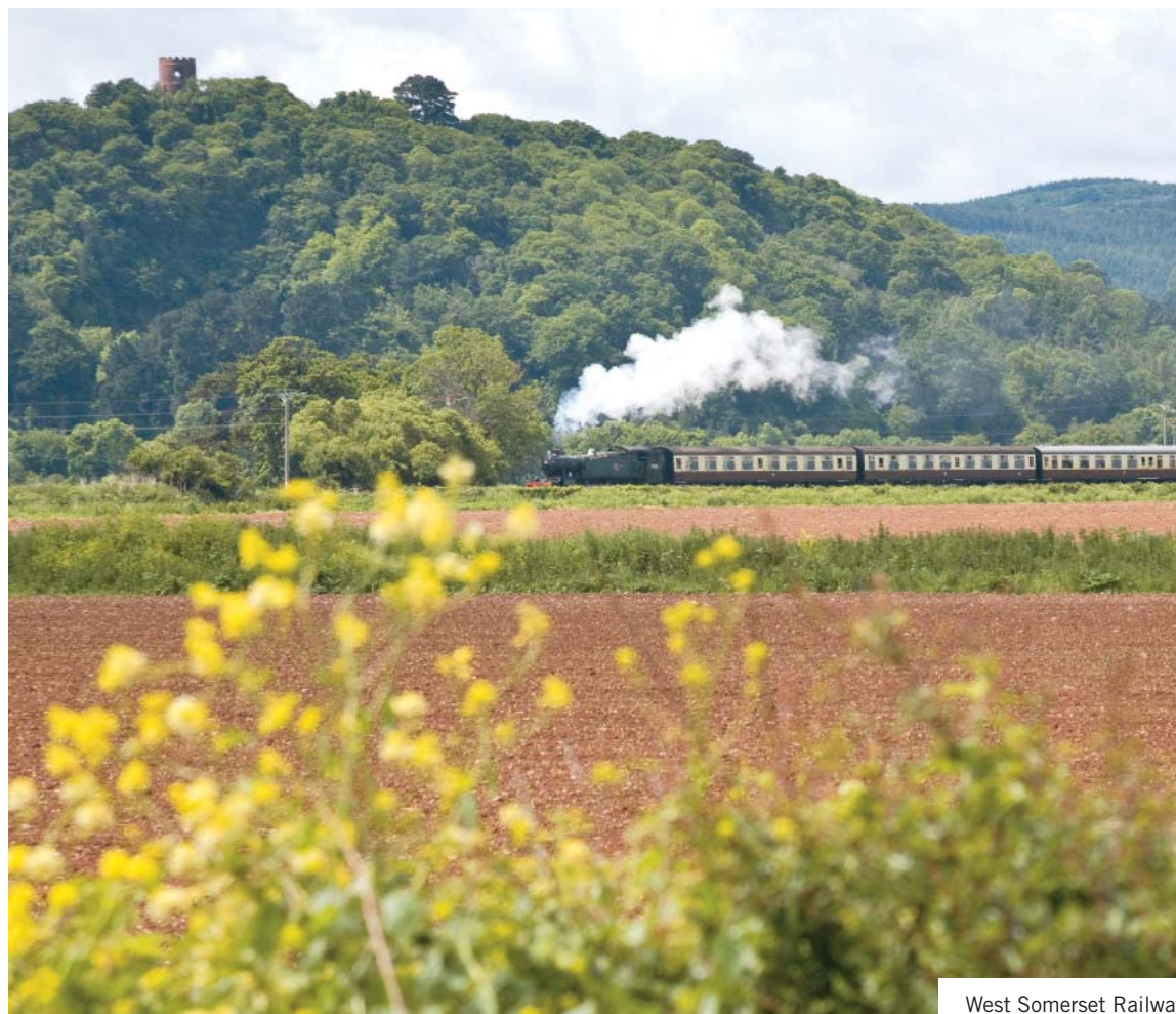
West Somerset Railway

This document is also available in Braille, large print, tape and on disc and we can translate it into different languages. We can provide a member of staff to discuss the details. Please contact 0845 345 9166.