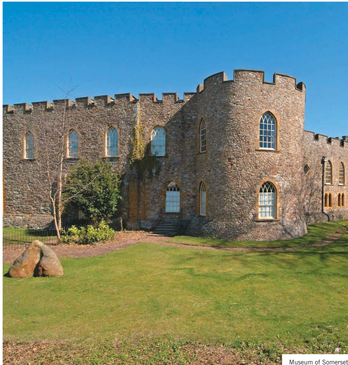
Museum of Somerset

"Hard work from school pupils and school teachers gave a big boost to exam results. Our 2010 GCSE results were up by an impressive five per cent."