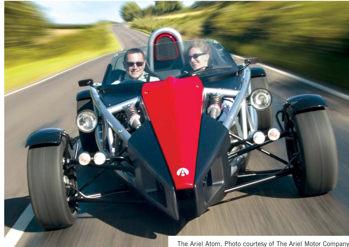
The Ariel Atom.

That meant that some services have been reduced, or in one or two areas, stopped completely. In other areas we are working hard with communities and partners to let local people have more of a say in running services. And, where appropriate, let them take them over completely. We want to make it as easy as possible for local people, with their knowledge and skills, to get involved in shaping what is done and how.