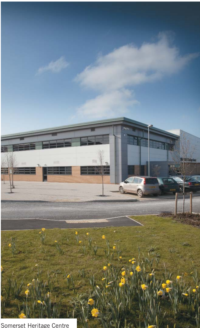
Somerset Heritage Centre