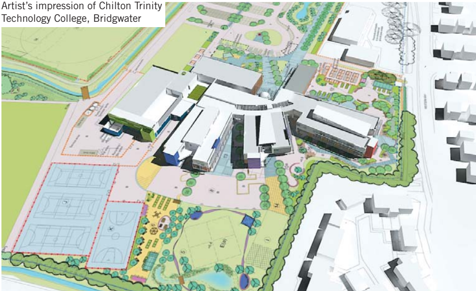
Artist's impression of Chilton Trinity Technology College, Bridgwater