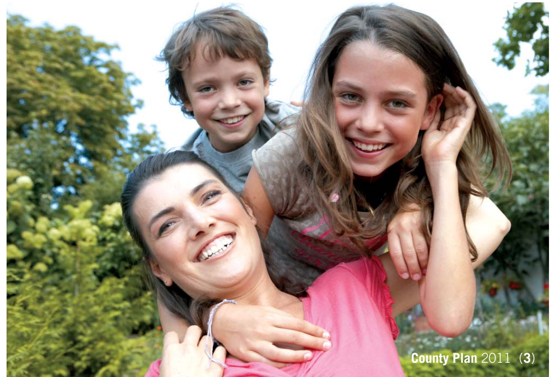
County Plan 2011 (3)