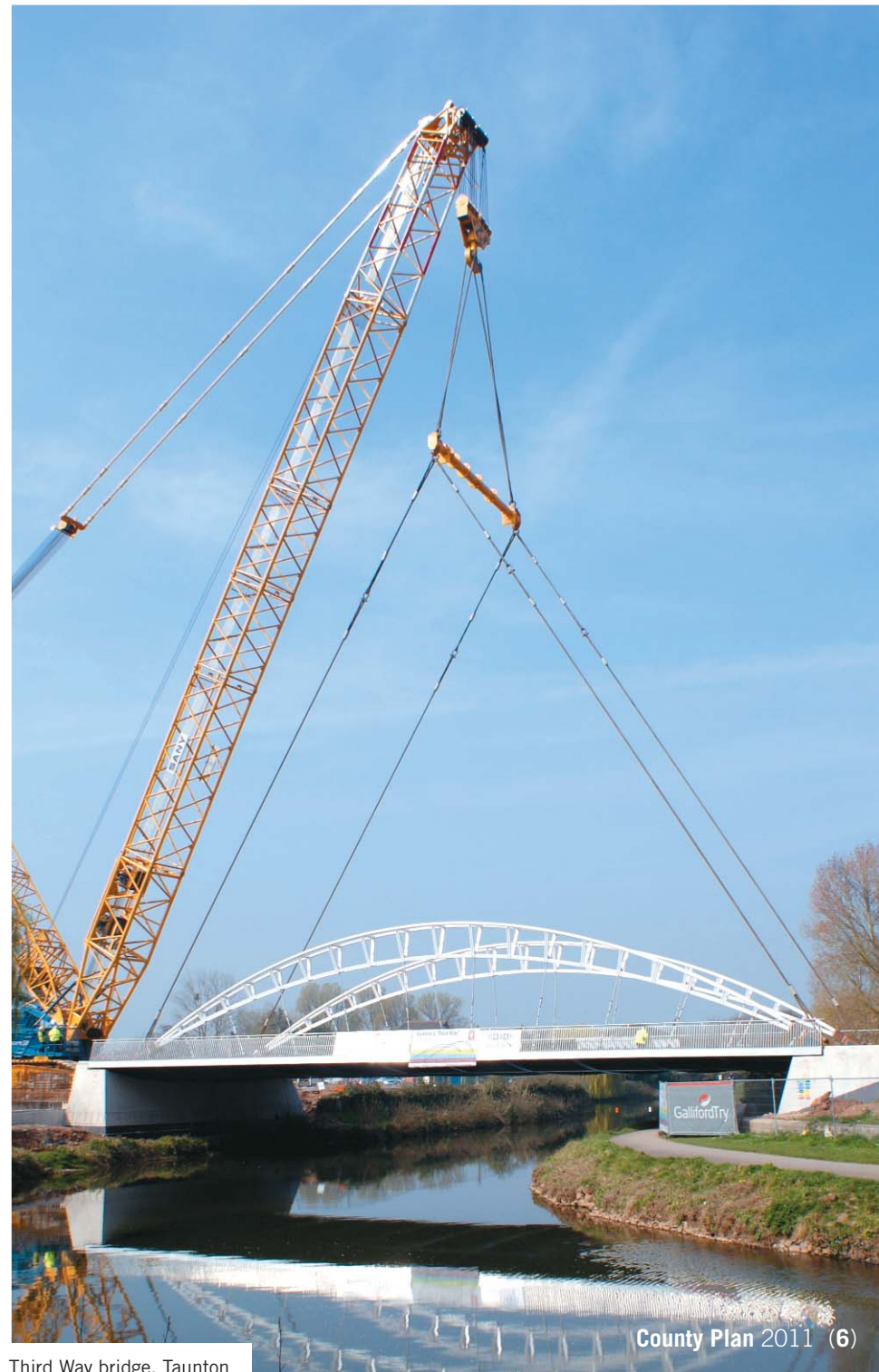
Third Way bridge, Taunton