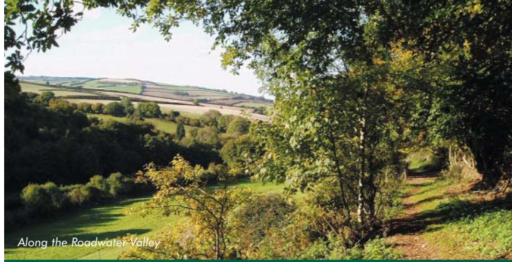
Along the Roadwater Valley